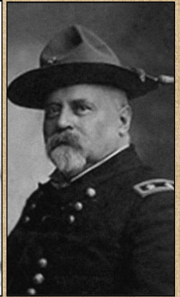
Fitzhugh Lee, ca. 1898 Major General, USV