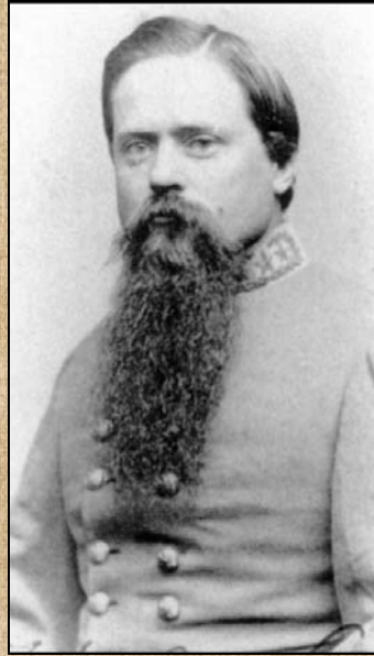
Fitzhugh Lee, ca. 1863 Major General, CSA

With the coming of a New Year comes the hope of a fresh start. I know that with the Jenkins Camp we are looking forward to continuing with our work of locating the graves of the Veterans here in the Carolinas and Georgia, as well as gathering in all information about them and their services; as well as planning for the camps annual Maine Day (February), Santiago Day (July), and Mexican War (August) Memorial Services for the year 2013. We are also looking forward to having new brothers and sisters joining the Order and helping to continue the work of preserving the memory of the Veterans so that upcoming generations will remember their sacrifices and services. Remember that we “are dedicated to preserving the memory of the Veterans who served from February 14th, 1898, to July 4th, 1902, in